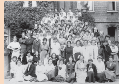
Boarders at St Mary’s Academy, 1914.