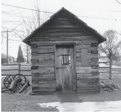
1853 log jail at its former site.

cern for the losses the clients have suffered and refusing to participate in the crass show of Clay's new friends. Clay also comes to understand that he has to make his peace with the victims of his greed, starting with Tequila Watson. Making amends also means that Clay cannot continue to practice law, but Clay achieves redemption by rejecting his greed and ambition.